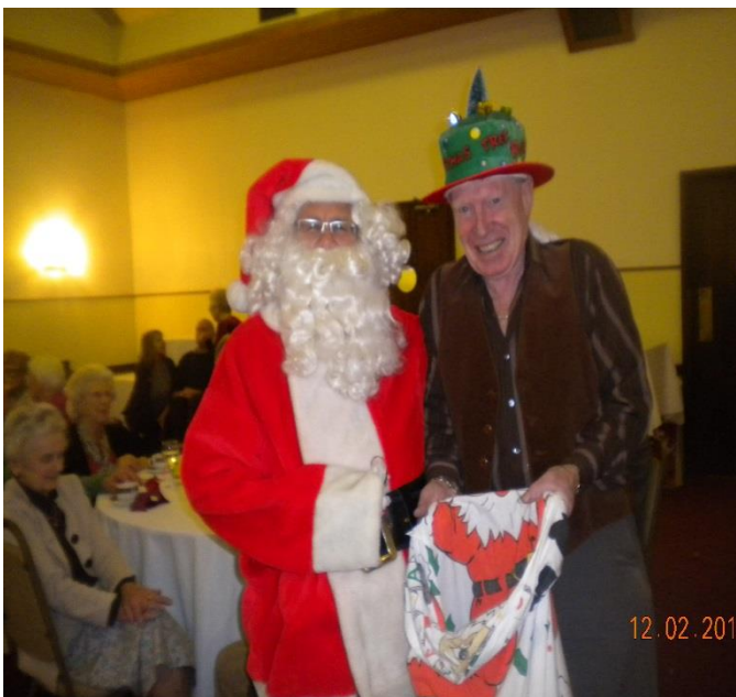
Santa and his helper

The views expressed in this Newsletter are taken in good faith and are not necessarily endorsed by the editor or the WRSG. The use of a product name does not constitute an endorsement by the WRSG