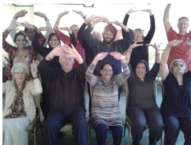
Members enjoying the Second Tai Chi Course