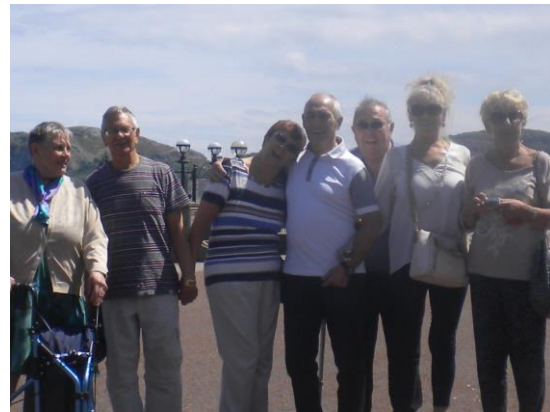
These pictures capture the amazing day out in Llandudno.

Our members enjoyed a great day out in Llandudno, the jewel of North Wales.